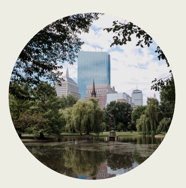
Hannah's guide to